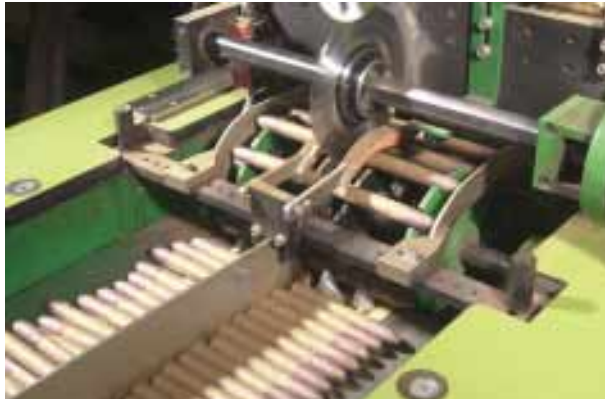
Bunch rod with reinforcement tape and proportionally distributed body filler and head filler prior to shaping.