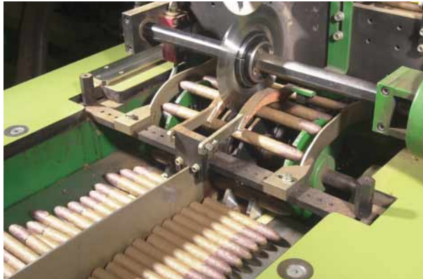
Bunch rod with reinforcement tape and proportionally distributed body filler and head filler prior to shaping.